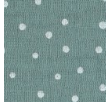
04671.025 OLD GREEN