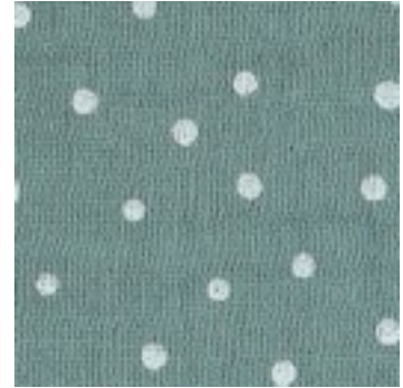
04671.025 OLD GREEN