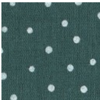
04671.034 DARK GREEN