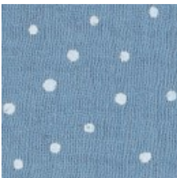
04671.020 LIGHT BLUE