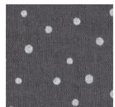
04671.022 DARK GREY