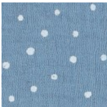
04671.020 LIGHT BLUE