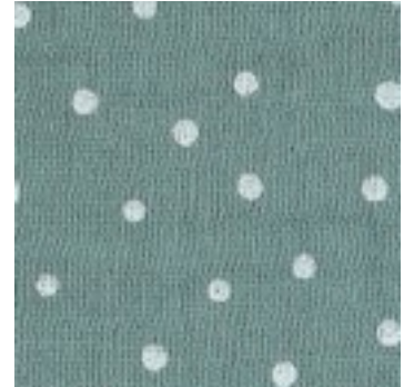
04671.025 OLD GREEN