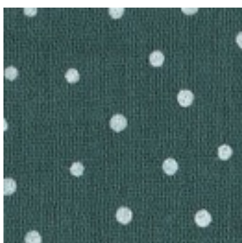
04671.034 DARK GREEN