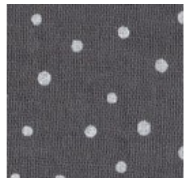
04671.022 DARK GREY