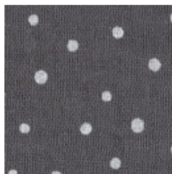
04671.022 DARK GREY