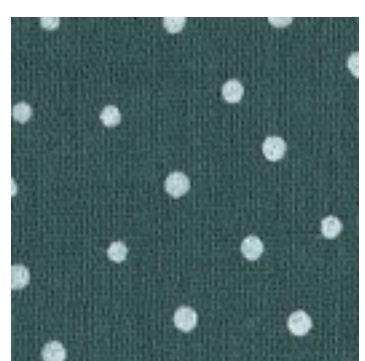
04671.034 DARK GREEN