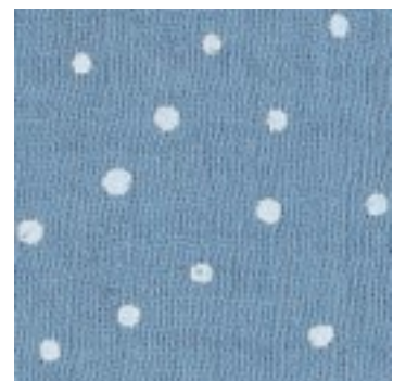
04671.020 LIGHT BLUE