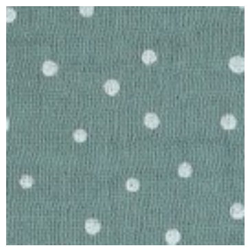
04671.025 OLD GREEN