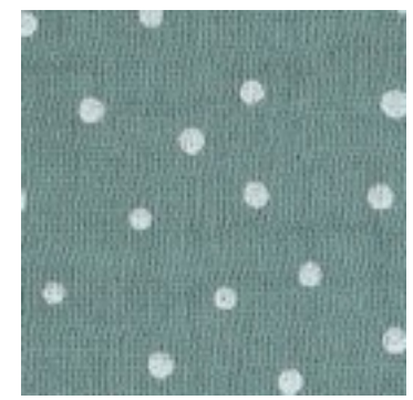
04671.025 OLD GREEN