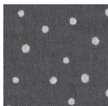
04671.022 DARK GREY