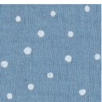
04671.020 LIGHT BLUE