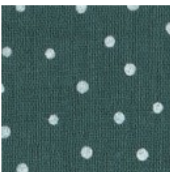
04671.034 DARK GREEN