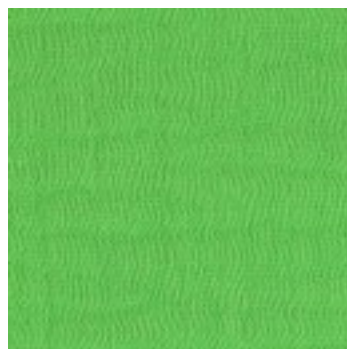
03959.069 LIME NEON