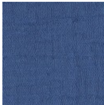
03959.078 MIDNIGHT BLUE