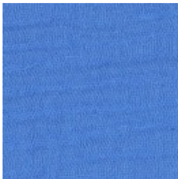
03959.077 ROYAL BLUE