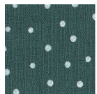
04671.034 DARK GREEN