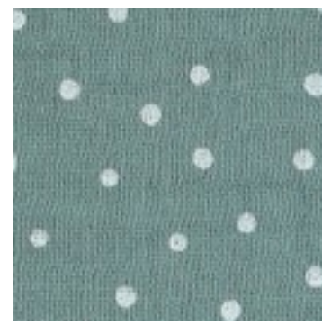
04671.025 OLD GREEN