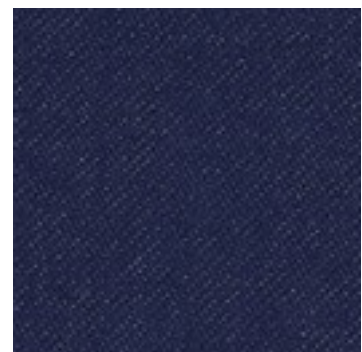
02530.027 DARK COBALT