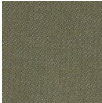
02530.023 ARMY GREEN