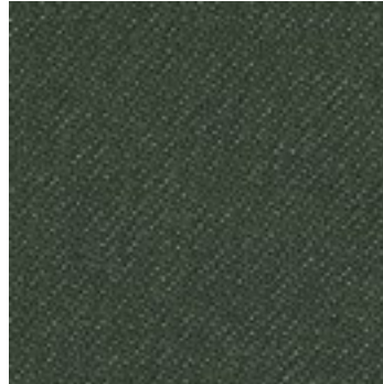
02530.018 DARK GREEN