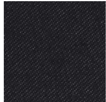
02530.011 DARK BLUE