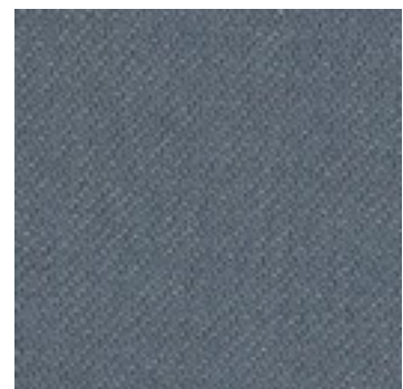
02530.016 BLUE GREY