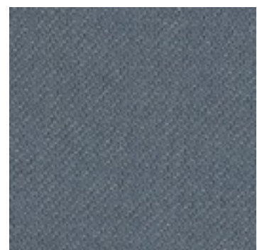
02530.016 BLUE GREY