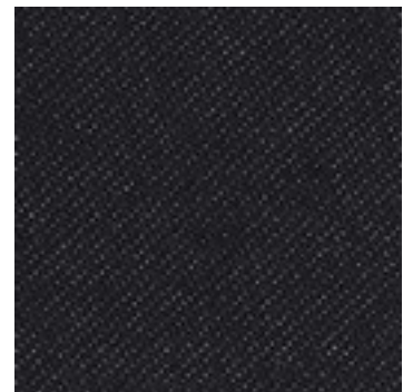
02530.011 DARK BLUE