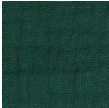
03959.040 OLD GREEN