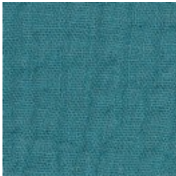
03959.038 BLUE SHADOW