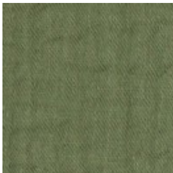
03959.041 MOSS GREEN