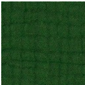
03959.042 DARK GREEN