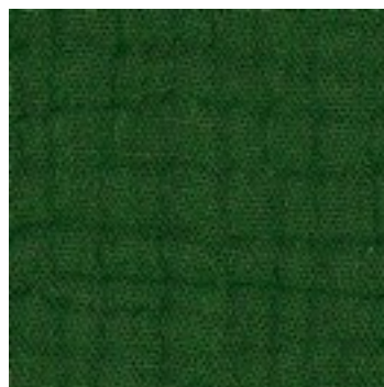
03959.042 DARK GREEN