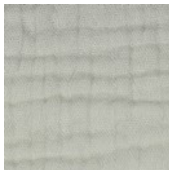
03959.045 LIGHT SAND