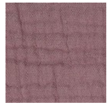
03959.049 LIGHT LILAC