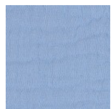
03959.055 LIGHT BLUE