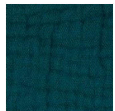
03959.052 DARK CYAN