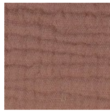
03959.048 OLD BLUSH