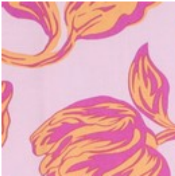
05495.001 LIGHT PINK