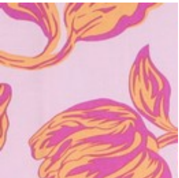
05495.001 LIGHT PINK