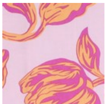
05495.001 LIGHT PINK