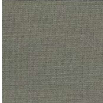
03800.029 ARMY GREEN