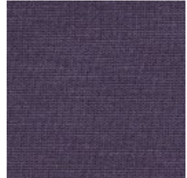
03800.030 DARK PURPLE