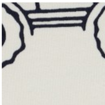
04137.002 OFF WHITE