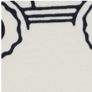
04137.002 OFF WHITE