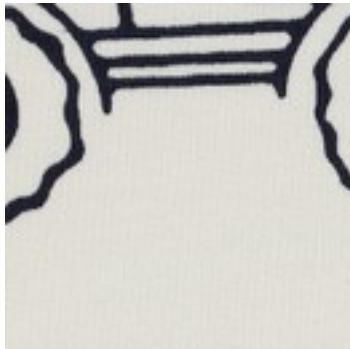
04137.002 OFF WHITE