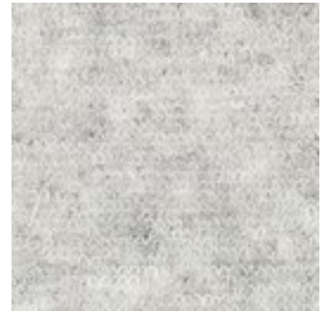
04591.004 LIGHT GREY