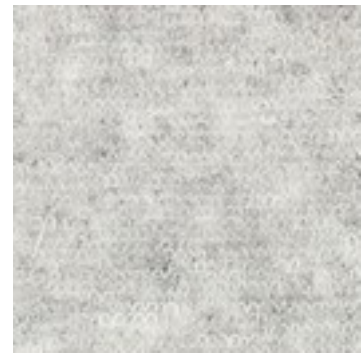
04591.004 LIGHT GREY