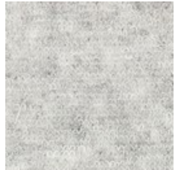
04591.004 LIGHT GREY