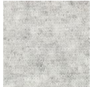
04591.004 LIGHT GREY