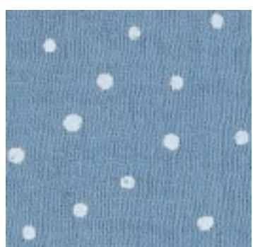
04671.020 LIGHT BLUE