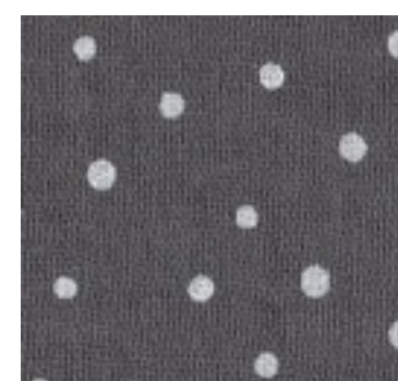
04671.022 DARK GREY