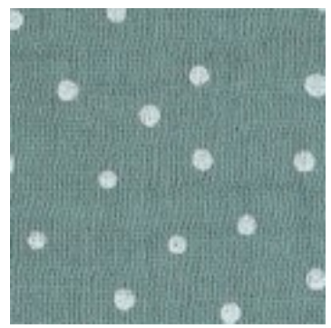
04671.025 OLD GREEN