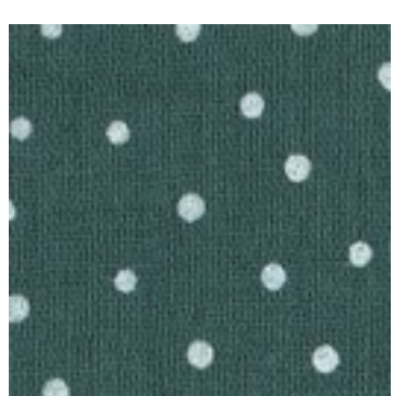
04671.034 DARK GREEN