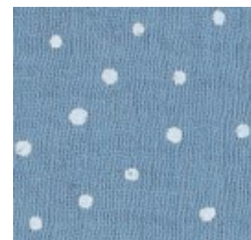
04671.020 LIGHT BLUE