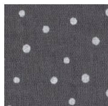
04671.022 DARK GREY