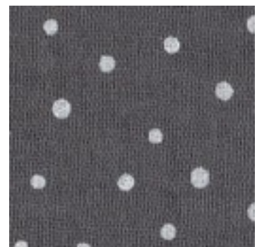
04671.022 DARK GREY