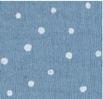
04671.020 LIGHT BLUE