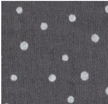
04671.022 DARK GREY