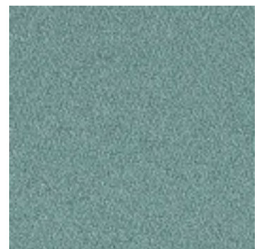
03710.025 OLD GREEN