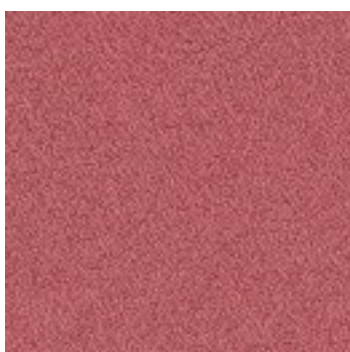
03710.039 ROSE WOOD