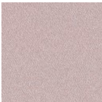
03710.023 DARK POWDER