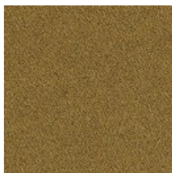
03710.040 MOSS GREEN