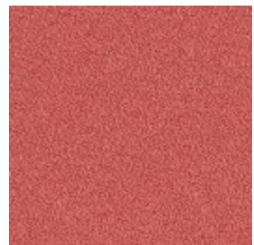
03710.038 DARK BLUSH