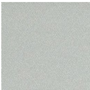
03710.012 LIGHT GREY