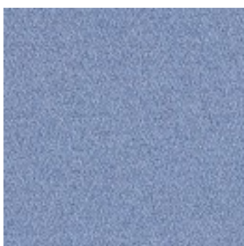
03710.026 BLUE SHADOW