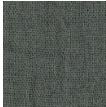
03959.002 DARK GREY