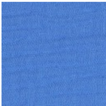
03959.077 ROYAL BLUE