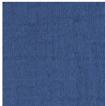
03959.078 MIDNIGHT BLUE