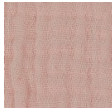
03959.007 OLD ROSE