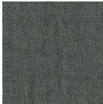
03959.002 DARK GREY