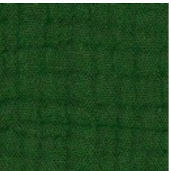
03959.042 DARK GREEN