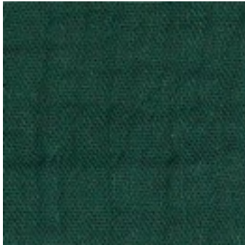
03959.040 OLD GREEN