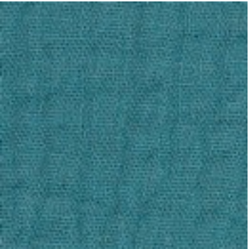
03959.038 BLUE SHADOW