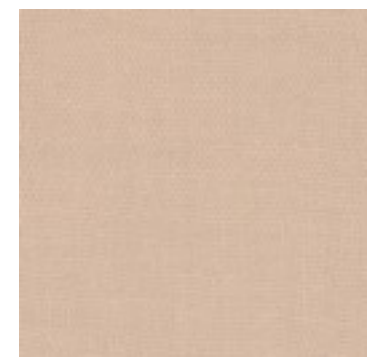
03959.025 LIGHT SALMON