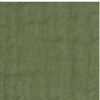
03959.041 MOSS GREEN