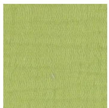
03959.064 OLD LIME