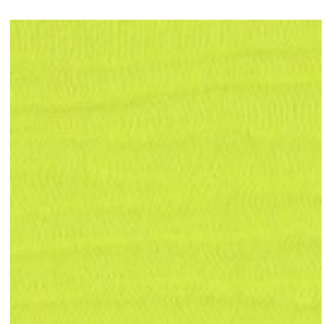
03959.070 YELLOW NEON