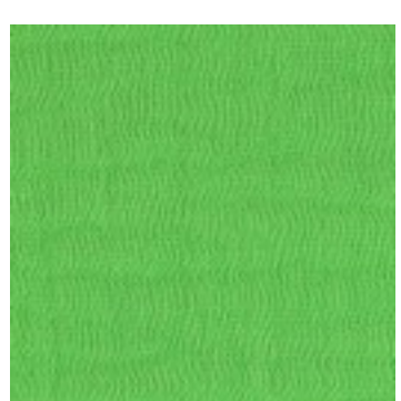
03959.069 LIME NEON