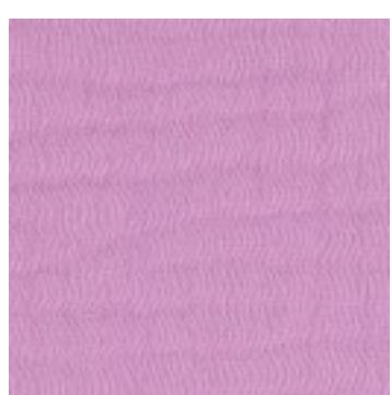
03959.065 LIGHT PINK