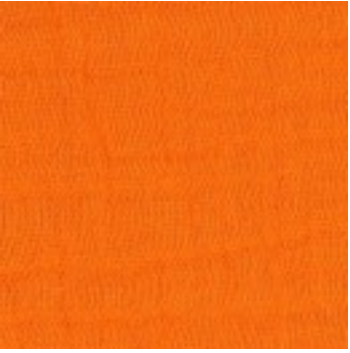
03959.071 ORANGE NEON