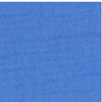
03959.077 ROYAL BLUE