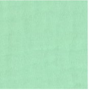
03959.072 LIGHT LIME