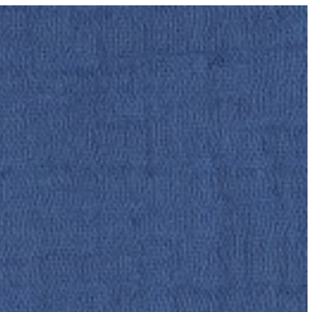
03959.078 MIDNIGHT BLUE