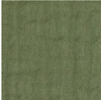
03959.041 MOSS GREEN