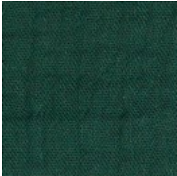
03959.040 OLD GREEN