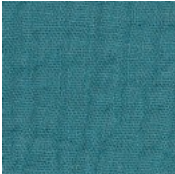
03959.038 BLUE SHADOW