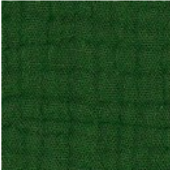
03959.042 DARK GREEN