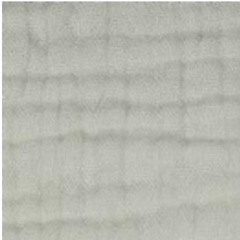
03959.045 LIGHT SAND