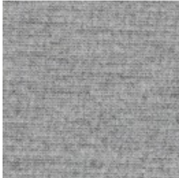
03800.012 LIGHT GREY MELANGE