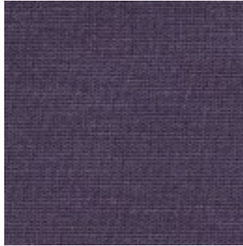
03800.030 DARK PURPLE