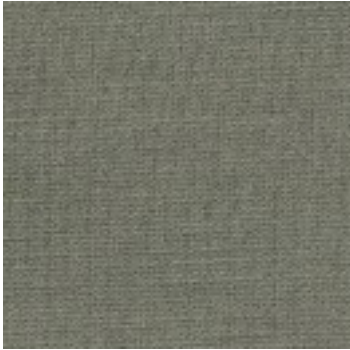
03800.029 ARMY GREEN