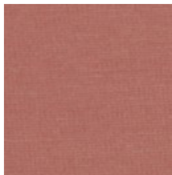
03800.024 OLD ROSE