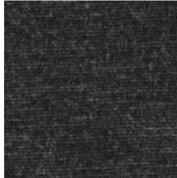
03800.014 DARK GREY MELANGE