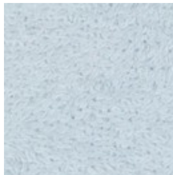
01882.005 LIGHT BLUE