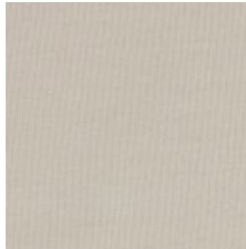
05828.004 LIGHT SAND