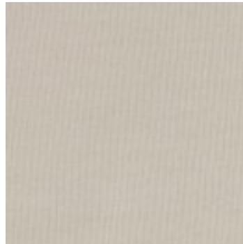
05828.004 LIGHT SAND