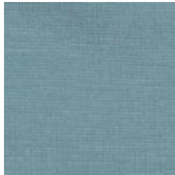
03800.020 LIGHT BLUE