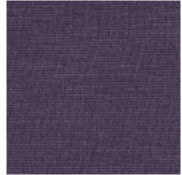
03800.030 DARK PURPLE