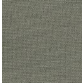
03800.029 ARMY GREEN