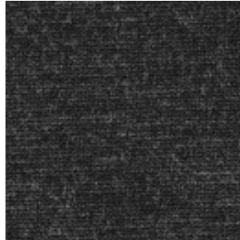
03800.014 DARK GREY MELANGE