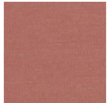
03800.024 OLD ROSE