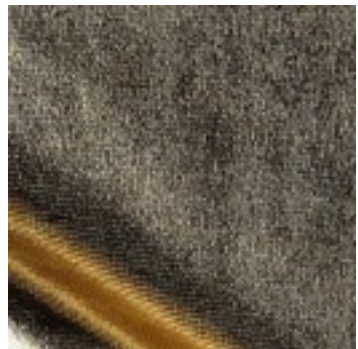
05190.001 LIGHT GOLD