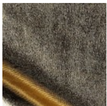
05190.001 LIGHT GOLD