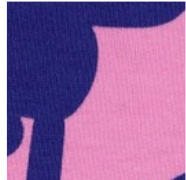
04059.003 LIGHT MAGENTA