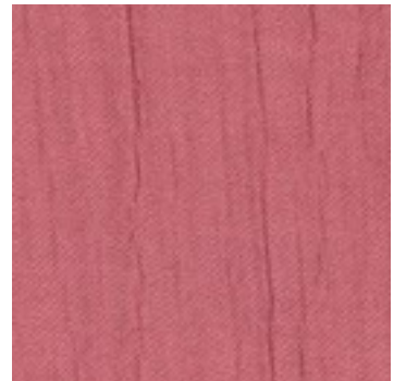
03496.006 DARK BLUSH