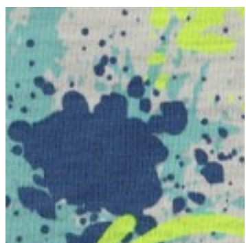
03077.002 ECRU MELANGE