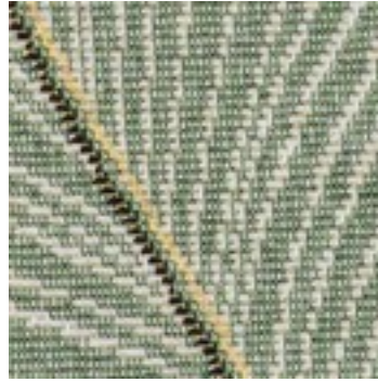
03334.003 SAGE GREEN